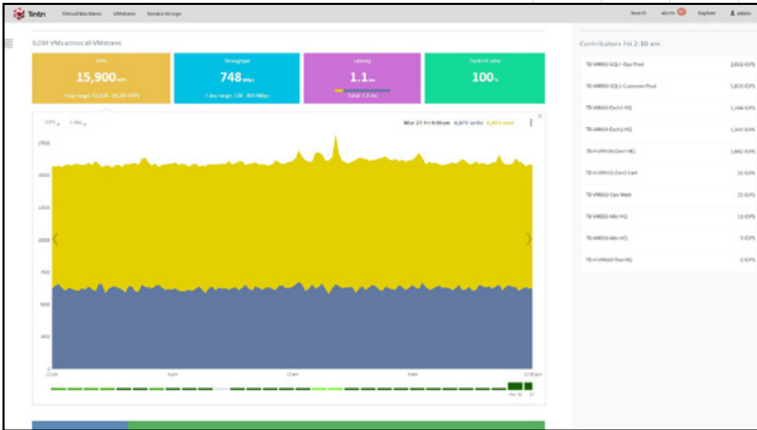
Figure 2 - Tintri Global Center – Virtual Machines Dashboard - Shows aggregate information & top 10 VMs with high IOPS